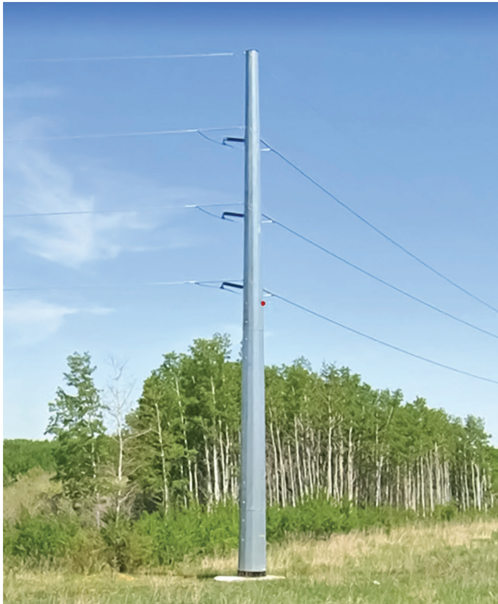
Example of Steel Monopole

The proposed steel monopoles will be approximately 21 meters in height.