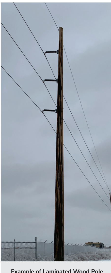
Example of Laminated Wood Pole