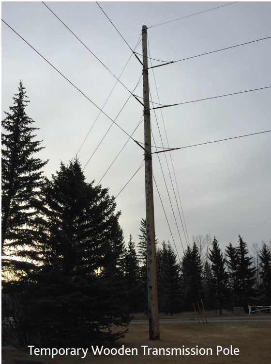
Temporary Wooden Transmission Pole