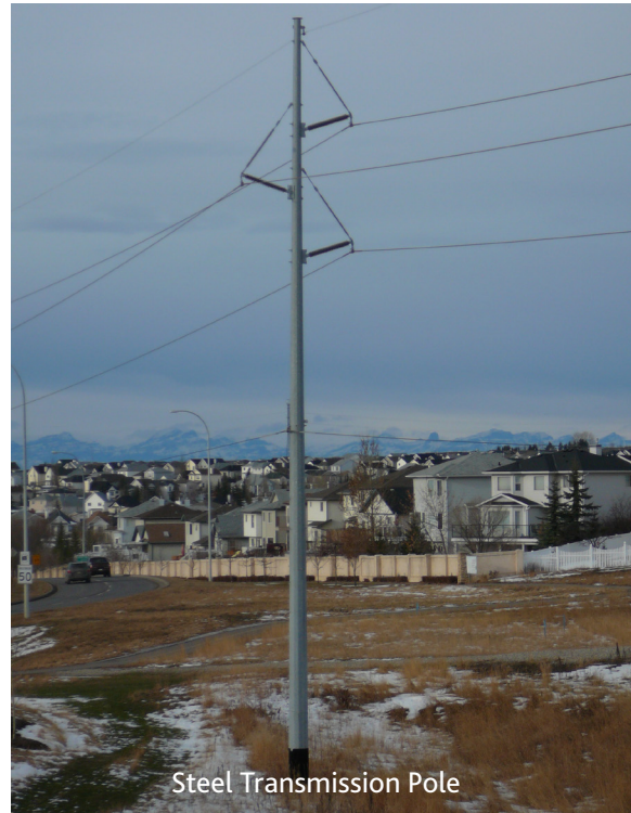
Steel Transmission Pole