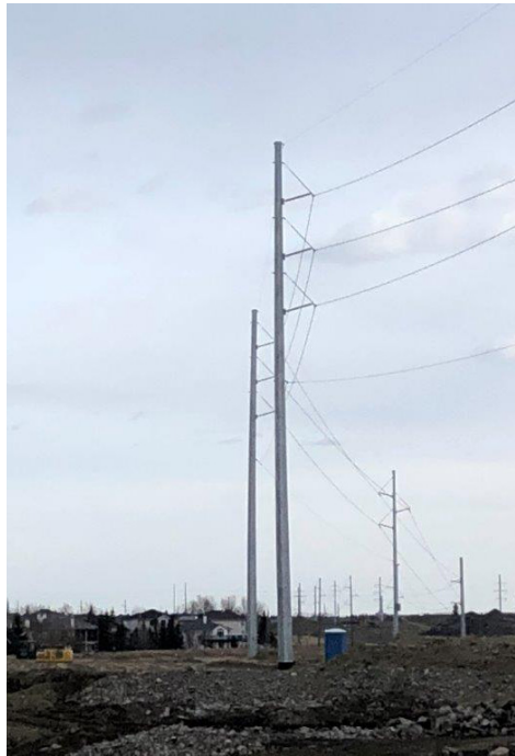
Proposed steel monopoles