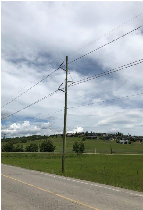
Existing and proposed wood poles

For more than 100 years, ENMAX and its predecessors have delivered safe and reliable electricity in Calgary.