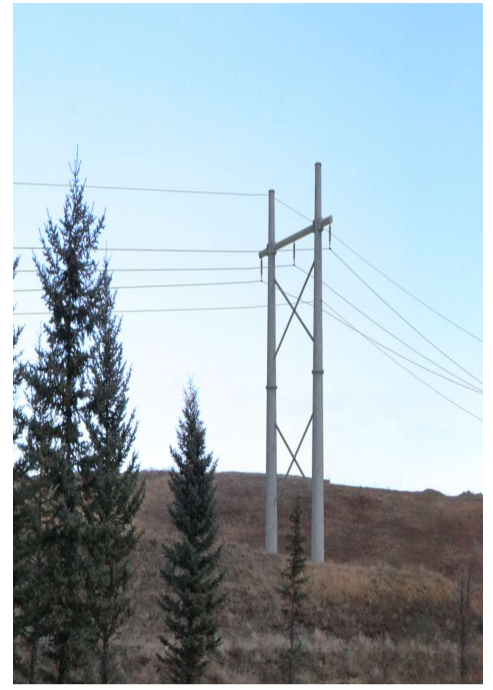
Example of the proposed steel H-frame