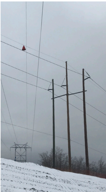
Existing three-pole wood structure

ENMAX plans to file an application for the Project with the Alberta Utilities Commission in Q2 2020. Subject to approvals being granted, construction is expected to start in Q2 2020, with an expected in-service date in Q3 2020.