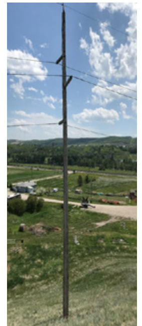
EXISTING WOOD POLE