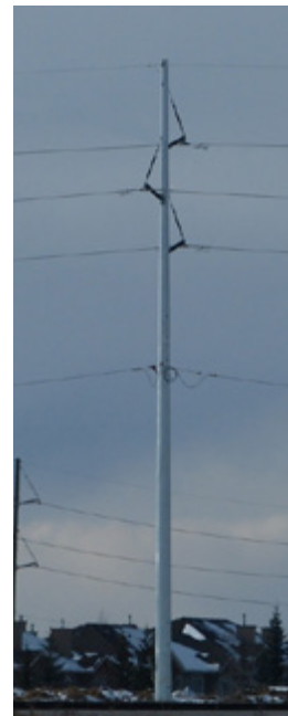
PROPOSED STEEL MONOPOLE

The existing wood poles range in height from approximately 18 to 27 meters. The new poles will range in height from approximately 21 to 31 meters.